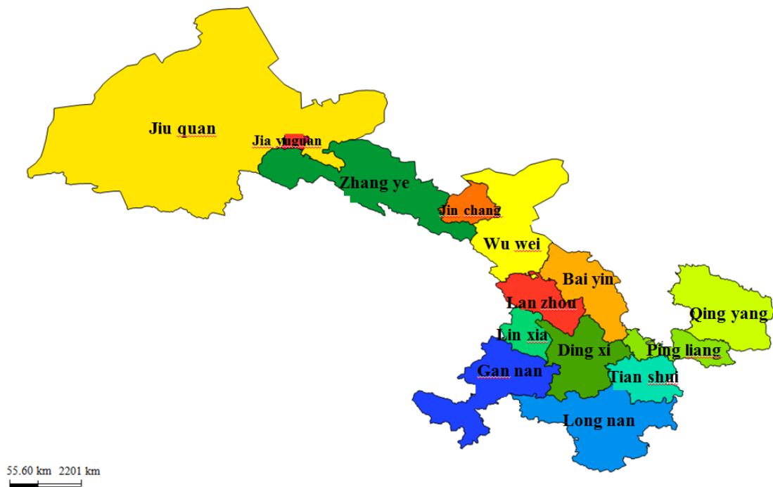
Figure 2. Classification of water resources sustainable development index for various administrative regions in Gansu Province.